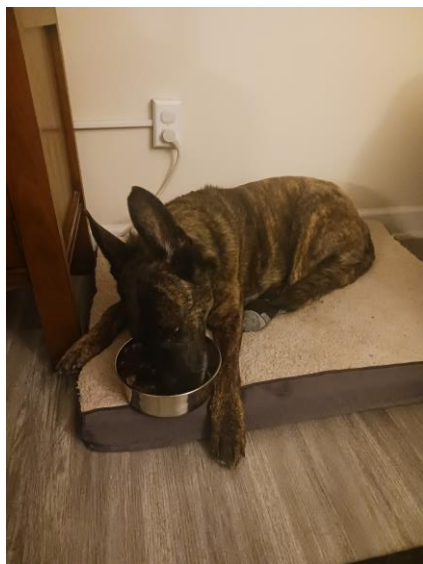
A - Breakfast in Bed

I thought we were done, but NO...there is more...Her tongue became sore on both sides. The doctor was puzzled. Unless we do a bunch of expensive testing, we do not know what it is. For now, we are observing it and will act accordingly...So, it's an open-ended story...But there is something positive: Myla got spoiled even more 😊 Here are two novelties of her enjoyable daily routine: