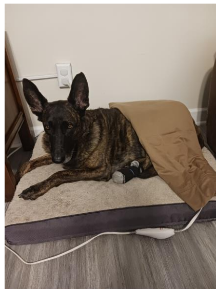
B - Spa - Heating Pad Before Bed Time

For two months, I could not focus on reading anything but the news, and I barely wrote anything structured, but journal entries. Only a month ago, I started reading some poetry: Rumi & contemporary, but I also fell upon a beautifully written novel that suited my state of mind, and I could not recommend it strongly enough. There is plenty of praise about the book, but it is one of those rich in images and ideas books where each person would find something different to reflect upon and marvel at. The main character is an ordinary man, who embarks on an extraordinary journey. It is a story of hope, transformation, and growth. To the film fans, the movie is coming soon too.