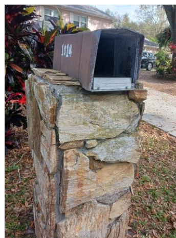
3-rock solid, but no door...

Which style is your mailbox? Do you want to change the style and why?