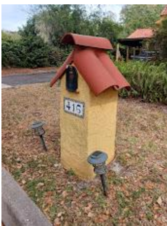
1-traditional- mini house

Here are three styles, Myla & I saw on our walks: