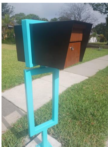
2-modern & colorful